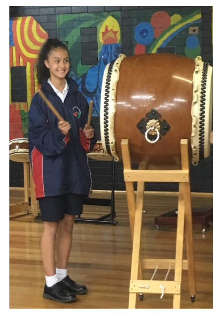
By acting in a positive, pleasant and optimistic way, you become a positive, optimistic and enjoyable person."